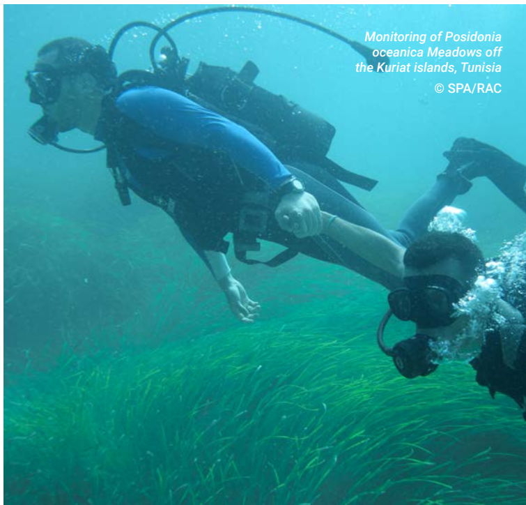
Monitoring of Posidonia oceanica Meadows off the Kuriat islands, Tunisia