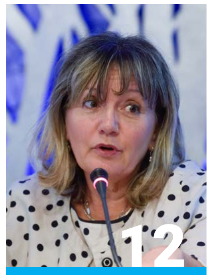
A word from the UNEP/MAP Coordinator