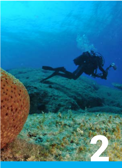
A push for the achievement of Good Environmental Status in the Mediterranean