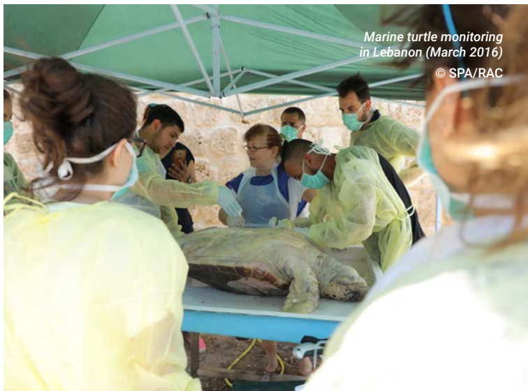
Marine turtle monitoring in Lebanon (March 2016)