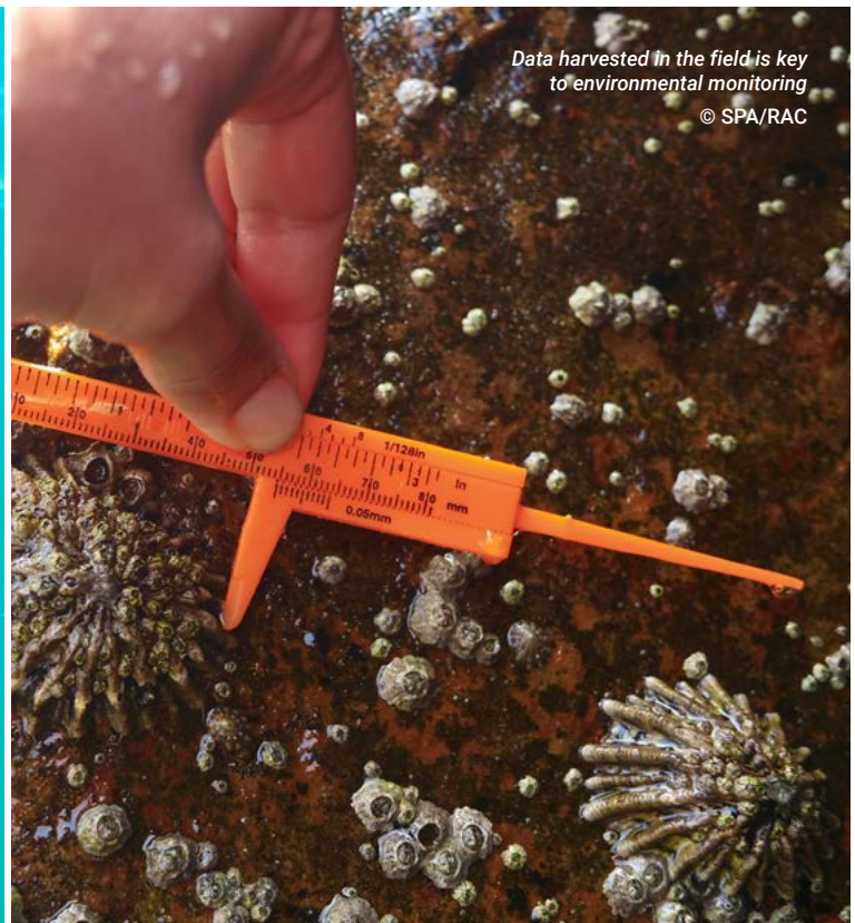
Data harvested in the field is key to environmental monitoring