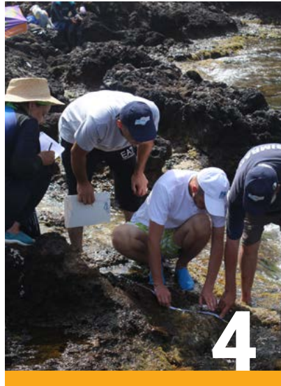
EcAp MED III