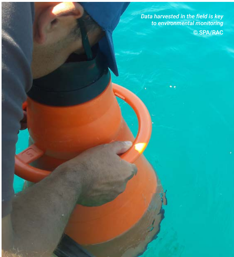
Data harvested in the field is key to environmental monitoring