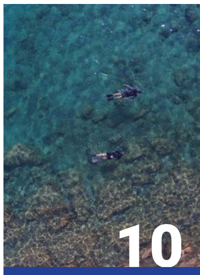
Views from the field