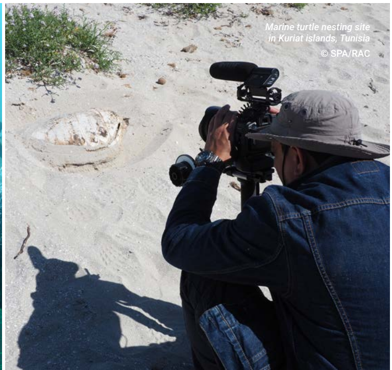
Marine turtle nesting site in Kuriat islands, Tunisia