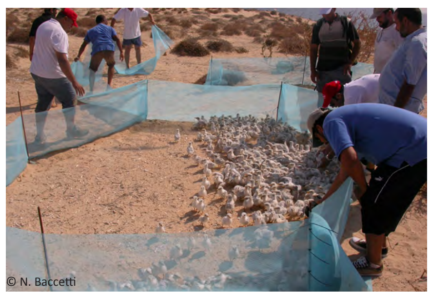
Figure 7: Ringing fence at Ulbah