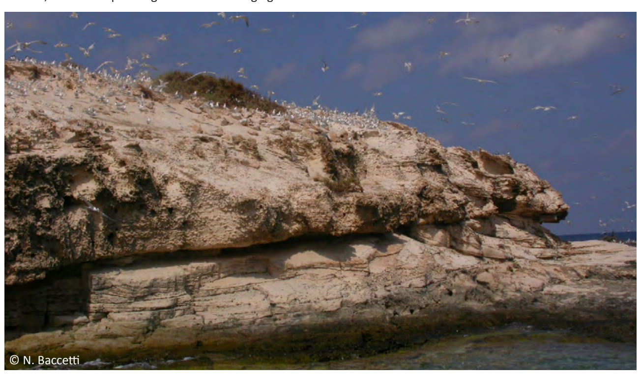
Figure 2: Colony site on cliff edge at Garah

2) Ground survey to assess number of breeding pairs and clutch size - Targets are determining the breeding population size (number of nests or pairs), fecundity (clutch size) and timing of breeding according to the nests' contents. Secondary target, only when opportunity arises, collecting diet samples. These three main targets can be achieved simultaneously. This action requires approaching the nesting area and, thus, forcing adults to temporarily leave their nests: to limit the effect of disturbance, it should take place in the shortest possible time (not exceeding 15 min.) and under ideal weather condition, with an adequate number of operators. We recommend to collect data according to two different methods, by separate teams working at the same time. One person should have the responsibility of checking the exact time when adults are flushed upon operators' arrival, and decide when 15 minutes have passed (setting the alarm clock on a phone can be useful). All the equipment needed should be ready at hand before the adults are flushed; do not bring extra stuff, binoculars etc. at the colony.