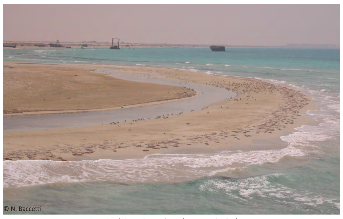
Figure 8: Adults resting on shore close to Zuetina harbour.

Timing. The visit must be performed in the early morning hours, to increase visibility and reading of rings and to reduce heat stress to eggs/chicks if adults temporarily move away from their nests.. Any hint of disturbance to the colony, especially when eggs or small chicks are present, should cause the interruption of the ring monitoring after 15-20 minutes. If availability of boats and people allows, several visits could be planned at various stages of the breeding season.