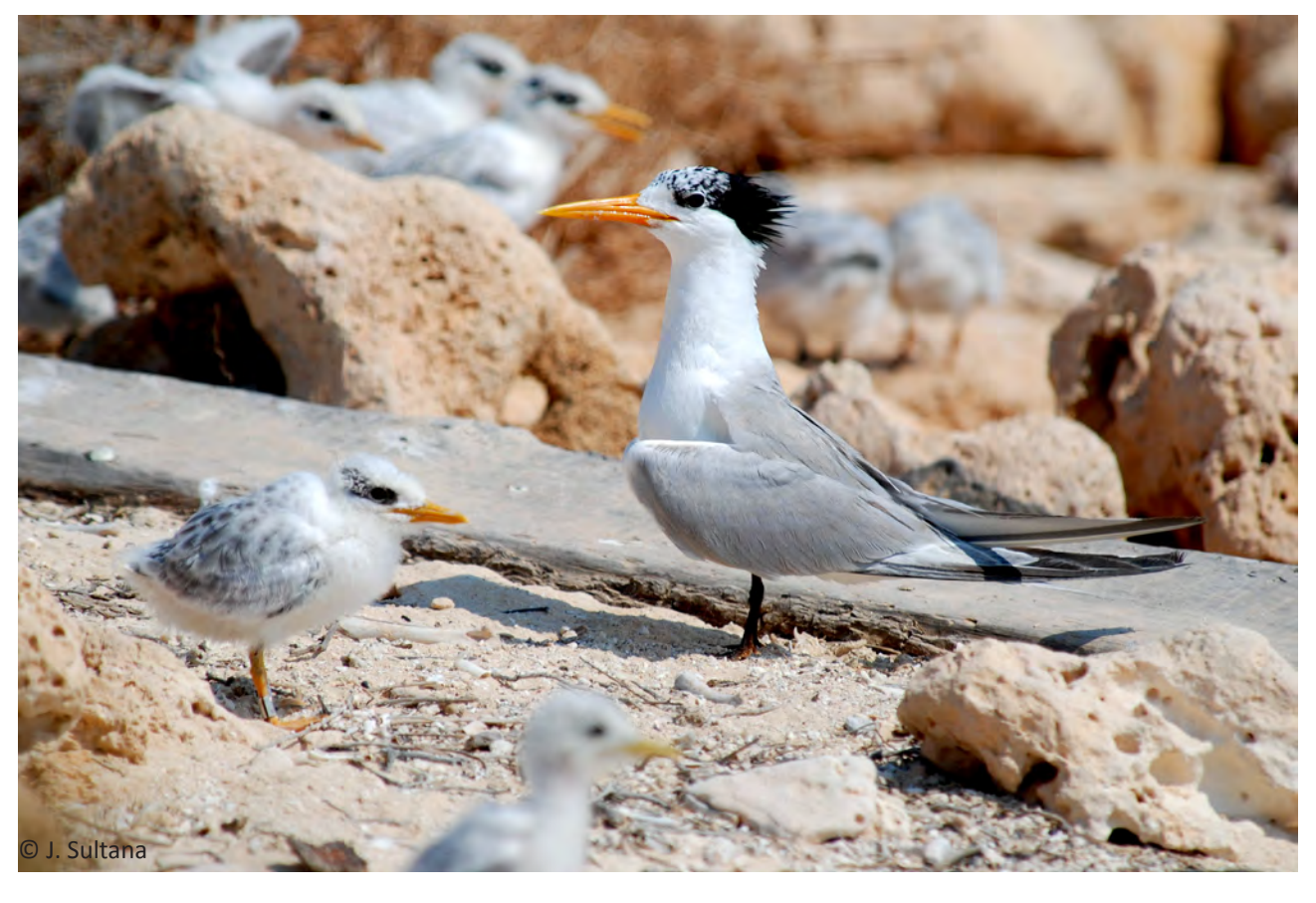
Figure 10: Adult and ringed chick at Garah