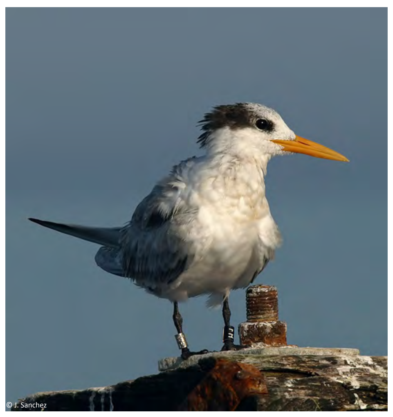
Figure 13: Colour-ringed Lesser Crested Terns from Libyan colonies, stopping-over at the Gibraltar strait. black FH \downarrow , Ceuta (Spain)

Every ring that is read through the telescope should be immediately noted on paper (colour and code), and immediately double checked. Additional elements to be recorded are leg (left or right), direction of reading (up or down), age of the bird, behaviour (in particular, breeding or not).