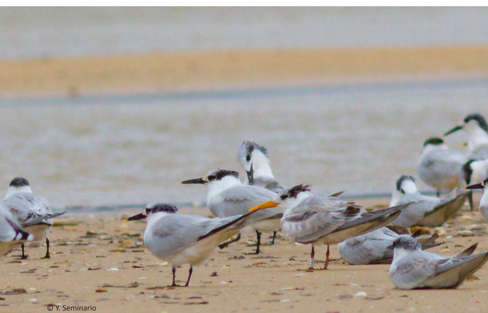
Figure 14: Colour-ringed Lesser Crested Terns from Libyan colonies, stopping-over at the Gibraltar strait. Above: white D04 \uparrow Ceuta; below: white D66 \uparrow Tarifa (Spain).