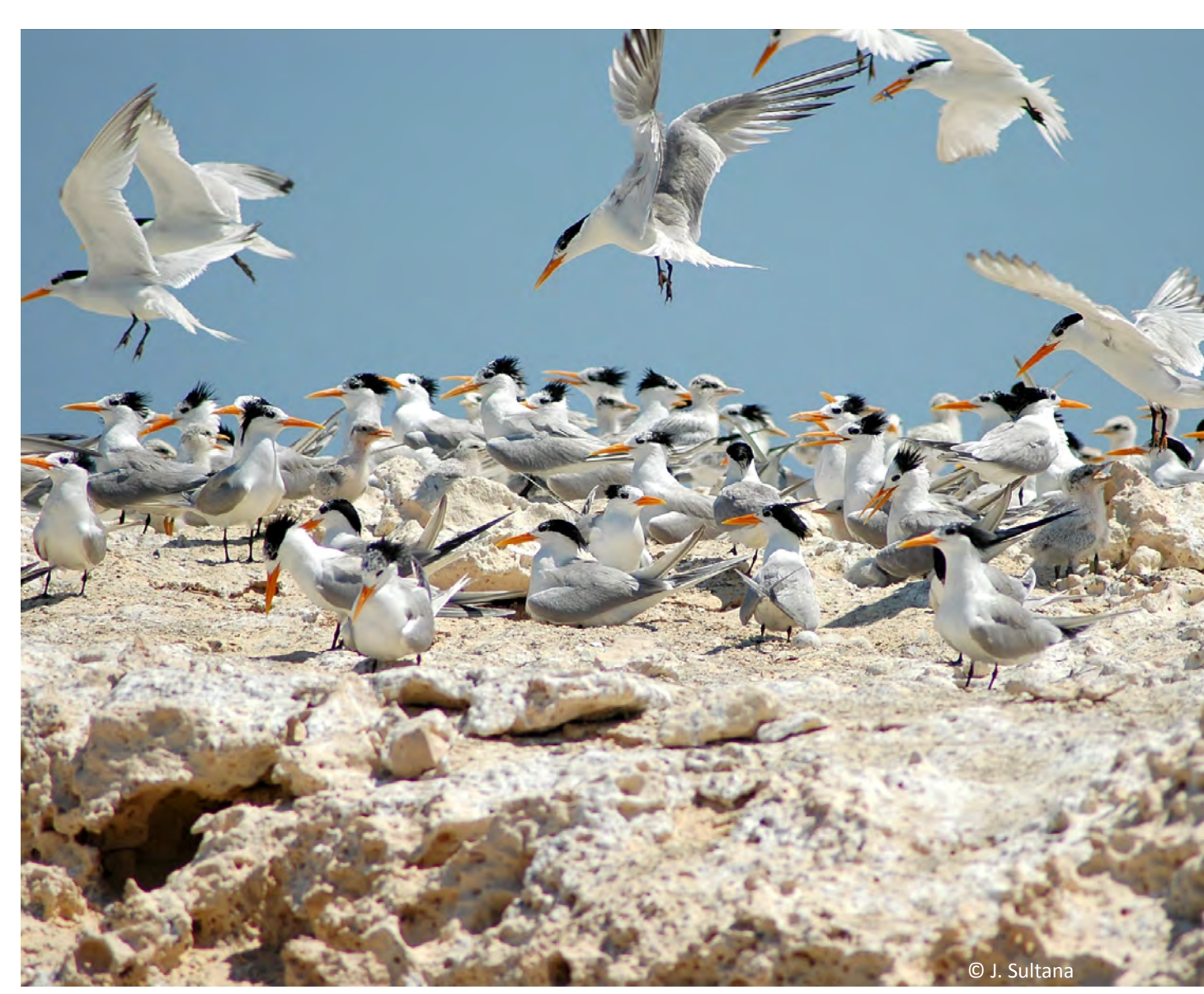
Figure 1: Breeding colony at Garah

For small colonies (up to 50 pairs), such as those at Bumbah, a visit by 1-2 people will allow a direct nest count with less than 5 minutes of disturbance for the adults (count and note first all nests with 2 eggs, then those with one, and eventually the empty nests). Colonies around 100-200 pairs can be best counted using one or two photos, without the need of ropes. Larger colonies require a more composite method, as described below for Garah.