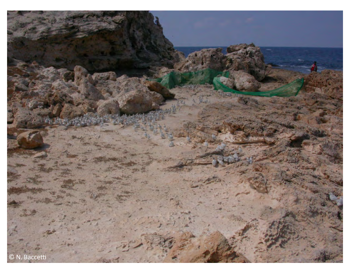
Figure 4: Chicks heading to the catching fence at Garah