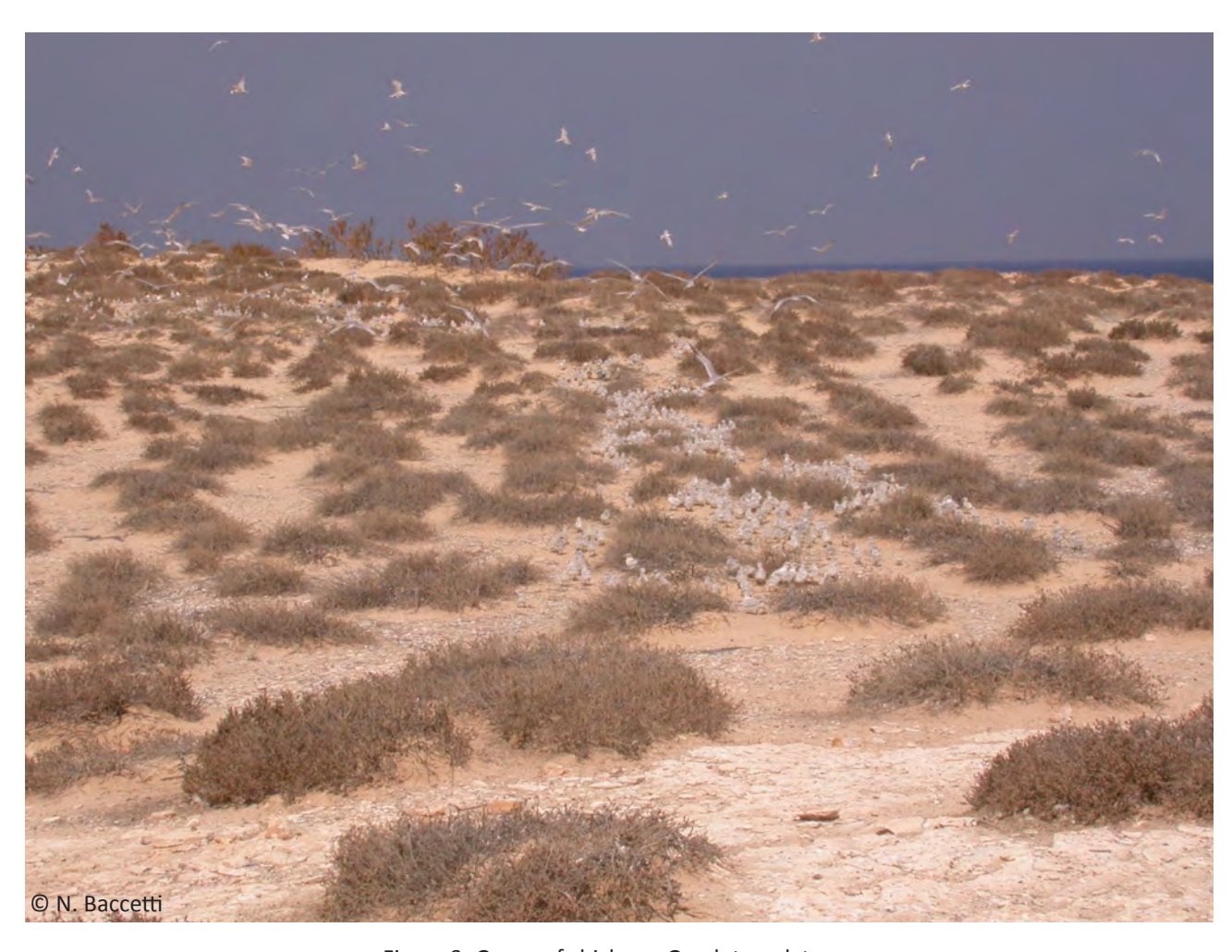
Figure 3: Group of chicks on Garah top plateau

Action B) Team of two operators only, start with unfolding the ropes on the ground, to roughly delimit counting sectors (ropes do not need to be straight, nor to go exactly from one edge to the other). One operator then takes photos of all parts of the colony, standing out of the edges and making sure that the ropes or any natural landmark are visible and wisely positioned in the monitor. The other operator gently removes all ropes, as soon as one of them has already been passed by the photographer. Do not make too many photos and do not use the same camera during the operation time for purposes other than nest counting, in order to simplify the photo identification process. No later than at the end of the same day, or better within a couple of hours, should photos be examined on a pc monitor and their position identified; only the useful shots should be selected and files conveniently named referring to the map on paper. The nest count can be done on following days, on a large monitor, counting separately 1-egg nests, 2-egg nests, empty scrapes that are recognizable as being nests, and groups of non-incubated (abandoned) eggs, if any. The sum of nests from all photos should be compared to the estimate obtained from nest densities (method A).