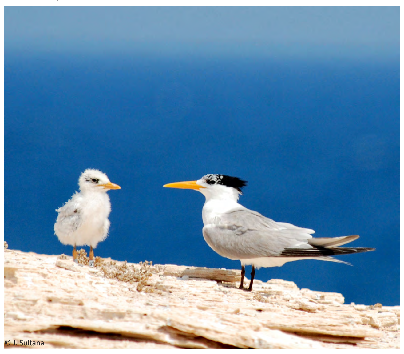
Figure 12: Adult and ringed juvenile (c. 10 days old) at Garah

Colour rings with inscribed alphanumeric codes must be made of special acrylic material, very strong, UV-resistant and unaffected by temperature changes. The best material so far available, used in Libya since the start of activities, is PMMA (poly-methyl-methacrylate). Engravings on the rings must be neat, so that codes can be read without confusion even from the distance. Letters and numbers forming the codes must be chosen as to reduce confusion (e.g. choose between pair of similar letters: P and R, O and zero, G and C...). Codes only composed by letters which can be read either upwards and downwards (e.g. O, H, N, S, Z, X...) should be discarded. It should be preliminarily checked that the chosen codes allow enough rings to be produced to cover the whole study requirements. It is always convenient alternating code orientation (up or down) during usage.