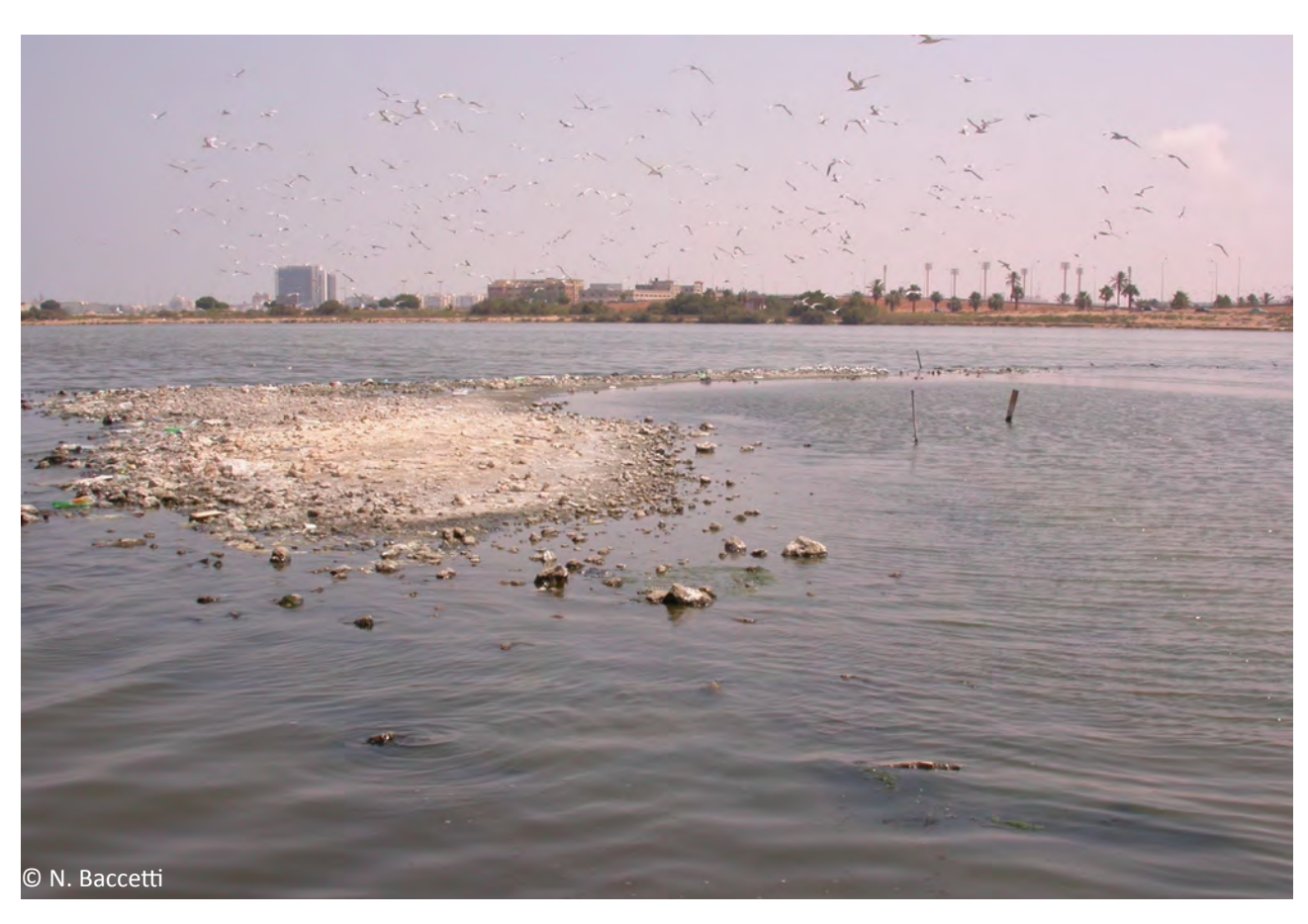
Figure 9: Colony site in Julyanah lagoon