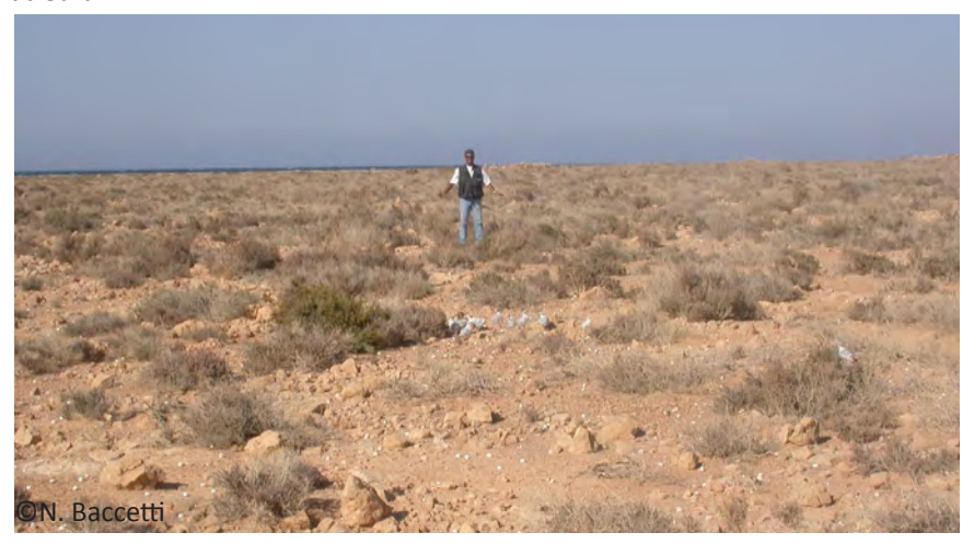
Figure 6: Chicks herded before capture, Ulbah

Timing. Every year, if the outcomes of previous surveys do not suggest to reduce the study efforts (e.g. due to excessive disturbance). The ideal date for the colony size assessment should fall at the end of the incubation period, but before the earliest chicks have hatched (1 July). An earlier survey (around 10 June) could help choosing the date more precisely, also accounting for year to year variation. The colony should be approached in the early morning hours, not later than 9 a.m., with an air temperature lower than 32°C. Keeping adults in flight later in the day (when the sun is higher above the horizon) and when the temperature is also higher would cause a mass death of the egg embryos in a much shorter time than the suggested 15 minutes.