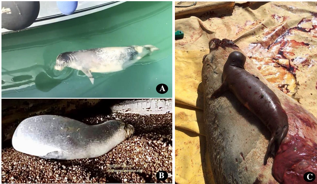
Figure 3: Individuals of Monachus monachus recently photographed in different localities of the Lebanese water. A: Dabyeh, 8 th of April 2020. B: Beir, 27 th of May 2017. C: Dead pregnant monk seal of around 2.5 m on the 4 th of April 2015 and after dissection, a baby of around 60 cm was found. Mytilineou et al., 2016)