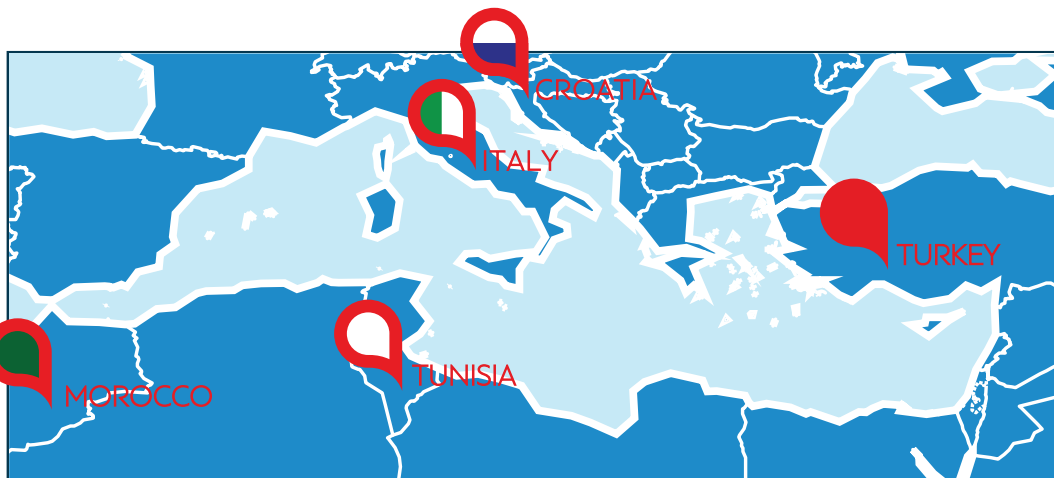
PROJECT INTERVENTION AREA