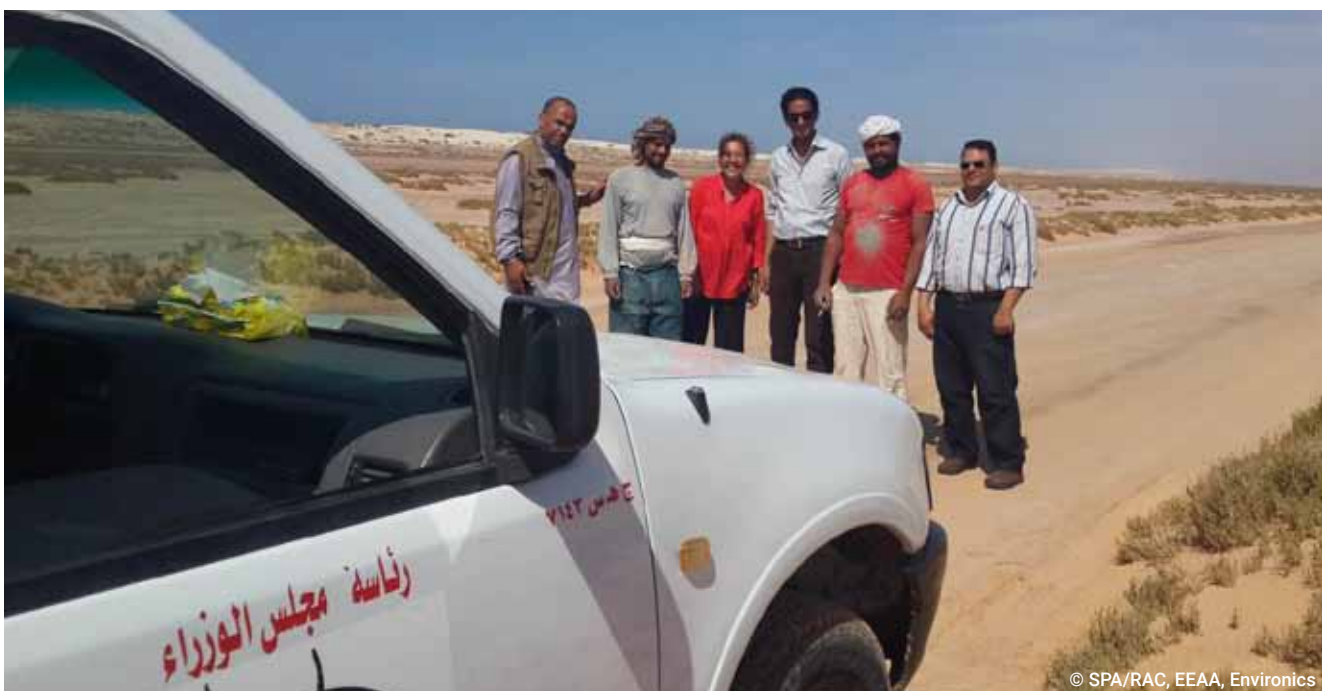
Figure 13: During Salloum MPA visit

The proposed management scheme of the MPA depends on many strategies of which zoning and community participation are the most appropriate. Three zones have been proposed: core, buffer, and transition. The management plan will delineate the different zones based on biodiversity data, objectives of the MPA, as well as the socioeconomic conditions of local communities. Activities allowed in each zone will follow specific management objectives. Community participation is one of the most important management strategies and tools. The NCS always encourages local community to participate in the planning and management process, especially where there are potential resource conflicts. The South Sinai and Red Sea Protectorates during the last 15-20 years have been involving and supporting local communities. The Salloum MPA will benefit from the experience gained by the NCS in this respect.