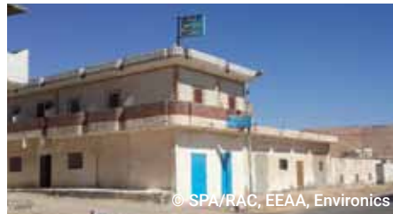
Beb Elbahr Hotel