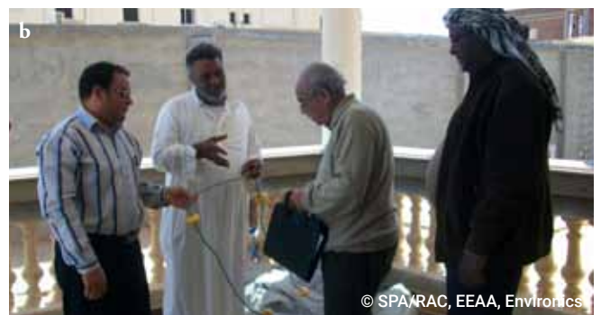
Figure 6 (a-b) : Group Discussion with fishermen group 2