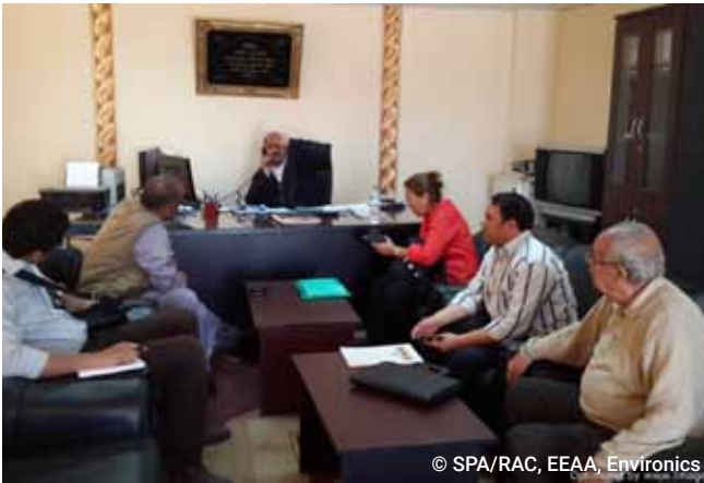
Figure 3: Interview with Head of Salloum City Council

A total of 17 Key Informant Interviews are conducted with key primary and secondary stakeholders in Salloum and Marsa Matrouh City 1 ; these are mainly local officials and natural leaders, Head of Salloum City Council, Urban Development Department, Planning Department, fishermen, birds' hunters, farmers, grazers, and Border Army (Figs 3-4).