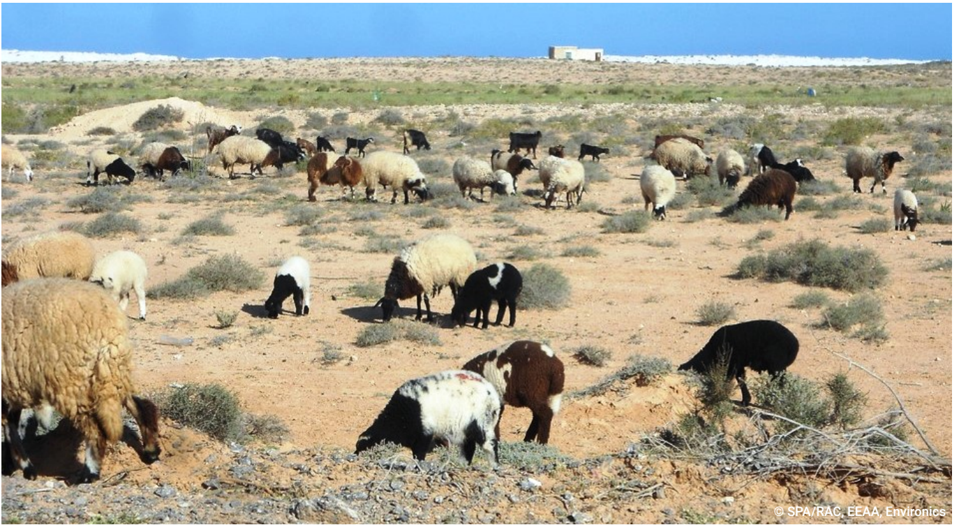
Figure 25: Grazing in the contiguous areas of the MPA