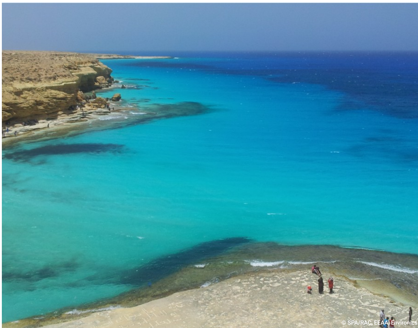
Figure 8: Ageeba beach

Matrouh has a great potential for agricultural development in terms of increase of cultivated areas and livestock breeding depending on water resources from the underground water, floods, torrential rain, and natural springs; in addition to El Hammam Canal. The Governorate is rich in its natural potentials and historical sites which forms great assets to Egypt's tourism future. The coast of Matrouh extends for over 450 km, where most of the beaches are sandy and ripped by calm bays providing a sense of safe aquatic activities, The most famous of these beaches is Ageeba, Cleopatra, Romeel and Boseet. Other tourist attractions include: Marina Monastery, the Mass Graves, the Military Museum, Ramses II Temple in Qum El Rakham, Cleopatra Pool, Siwa Oasis, and the hot sand in that cures dermatoid and rheumatic diseases. Other Environmental potential in Matrouh desert that attract professionals and researchers are rare plant species; there are more than 60 rare species in Matrouh desert along with natural protectorates in El Omayed and Siwa regions 4 .