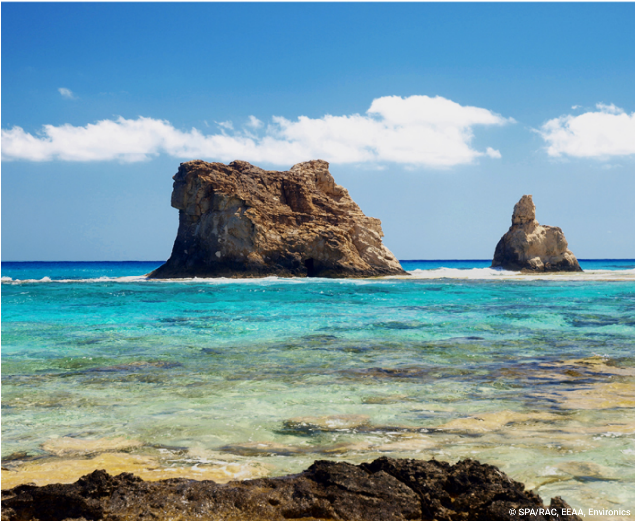
Figure 9: Cleopatra beach