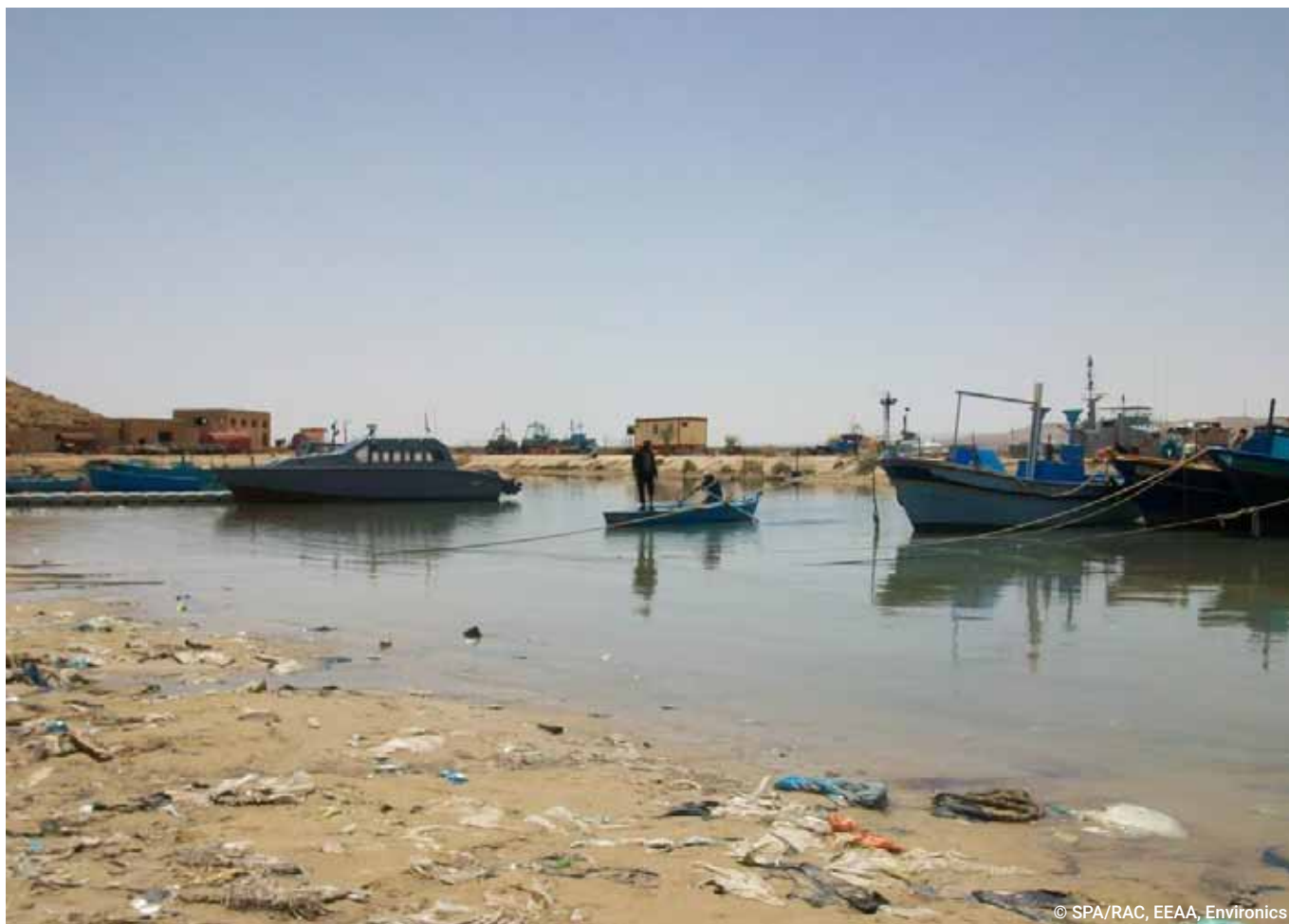
Figure 14: Part of the fishing fleet in Salloum MPA

Within discussions, it is confirmed that the total number of registered fishermen reaches 90 people out of total population of Salloum city which is 18000. There is a total of 20 fishing boats; 10 motor boats and 10 smaller feluccas.