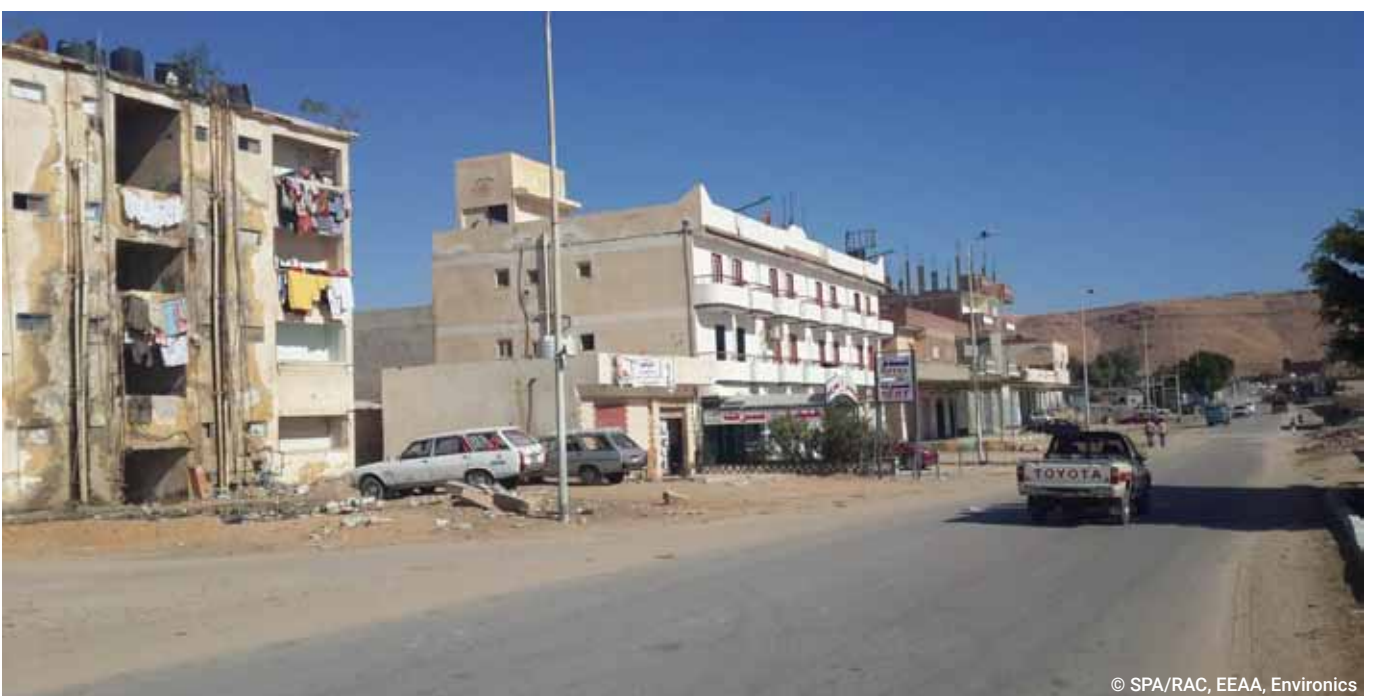
Figure 12: Housing conditions in Salloum