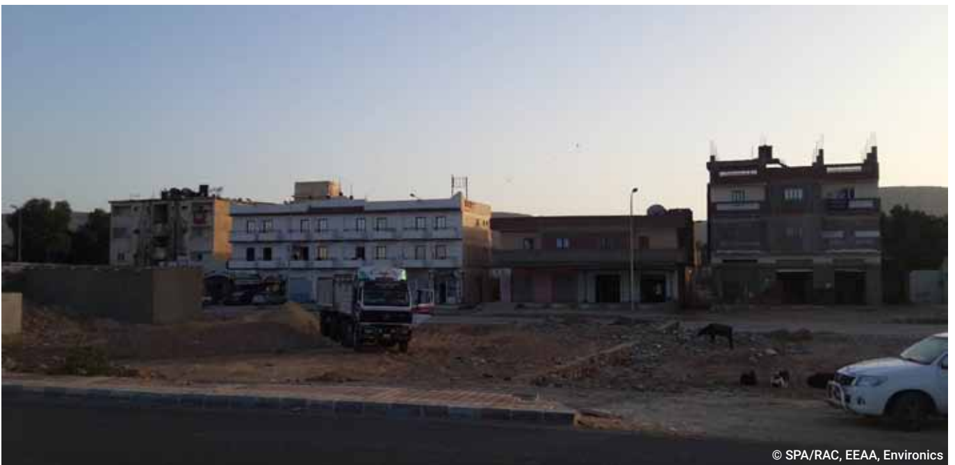
Figure 11: Physical environment in Salloum

The entire City is not connected to the public sewage network and households use septic tanks for municipal wastewater drainage. Another deficiency is solid waste management system; solid waste accumulations are frequently seen on the streets and the shore. As for social services; there is a total of 3 primary schools, 2 preparatory schools, one secondary, one commercial technical school, and one Azhar institute. In addition to one General hospital and another military hospital.