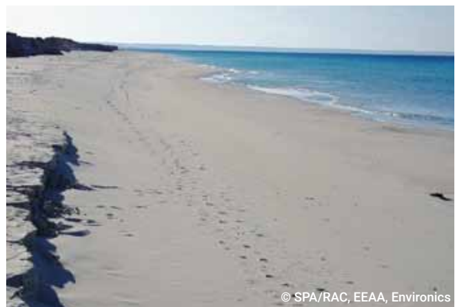
Figure 2: Site Visit