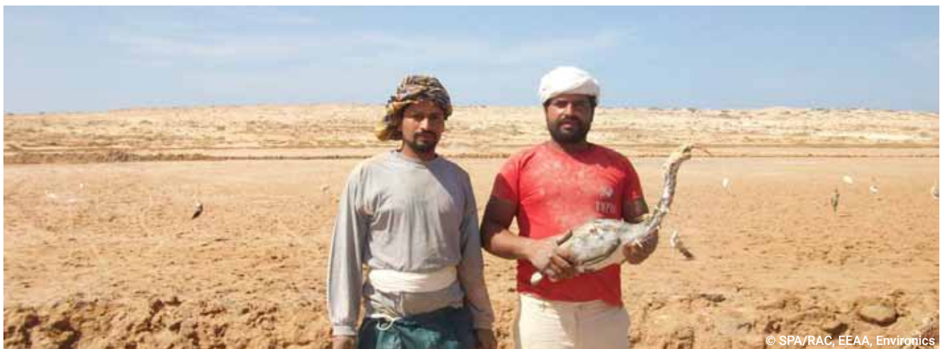
Figure 22: Artificial birds used to trick migrant birds