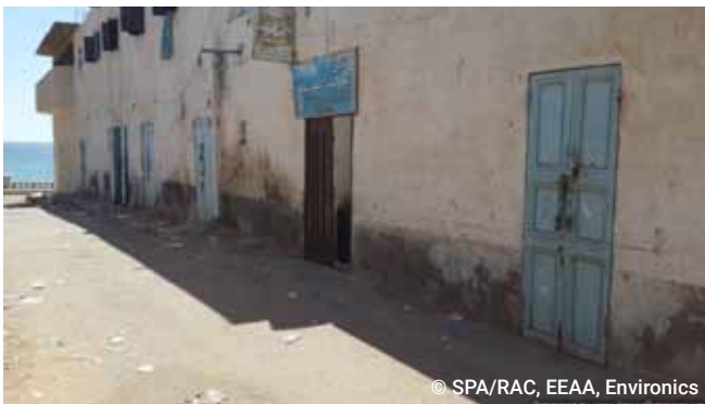
Poor physical condition of hotels