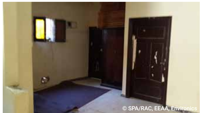
Poor standard of rooms in the hotels