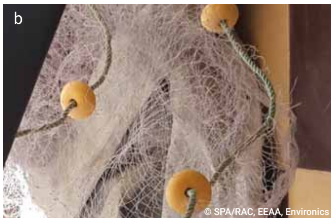
Figure 17: Fishing gill nets used for fishing