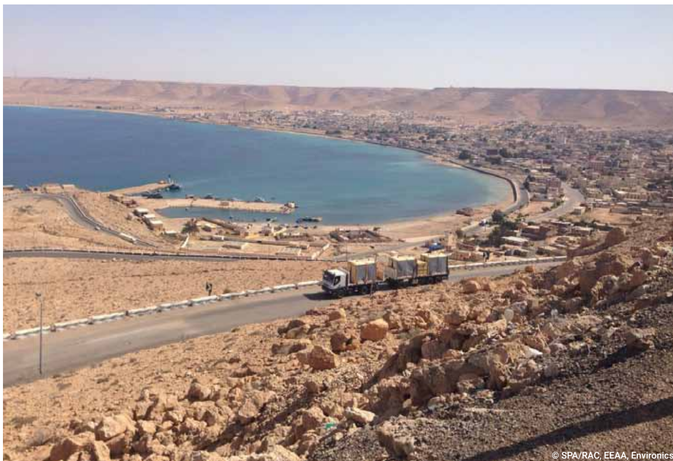
Figure 10: Salloum City

Salloum center (Markaz) and City is affiliated to Marsa Matrouh Governorate, which is located to the West of Alexandria Governorate on the Egyptian Border with