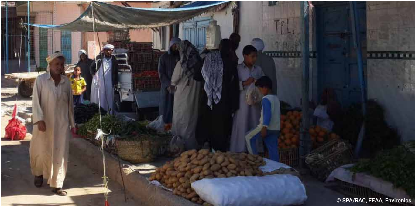
Figure 24: Small traditional Friday Souq in Salloum City