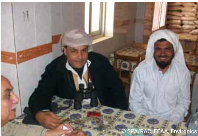
Figure 4: Interview with migrant birds' hunters