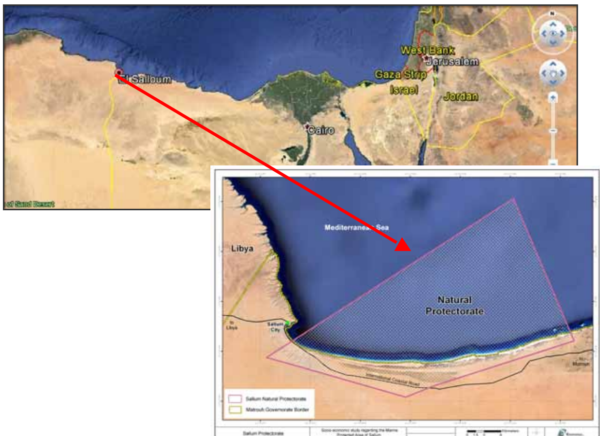
Figure 1: Salloum MPA boundaries