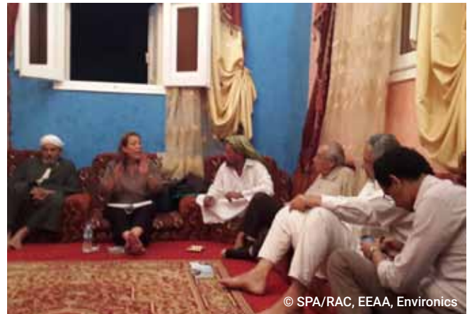
Figure 5: Group Discussion with fishermen group 1

Photography is also used to enhance participatory methods and reflect community concerns and issues. They also give a better idea of the nature of the local physical environment and livelihood activities to readers. In some places or situations, photos were not made possible because of social sensitivity or security reasons.