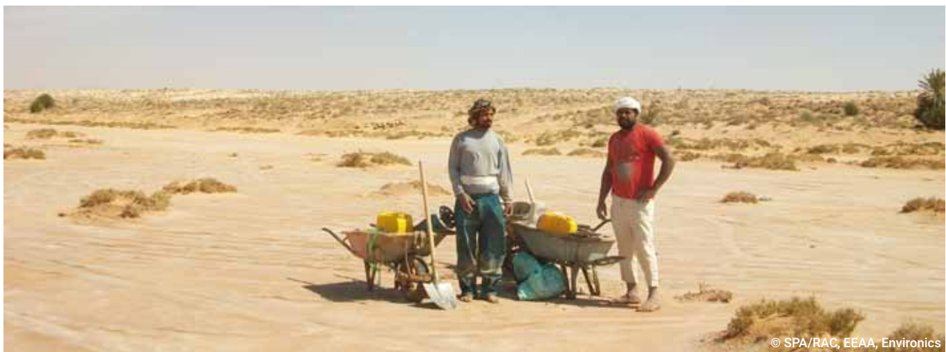
Figure 21: Preparation of the trap basins 'Bardeya'