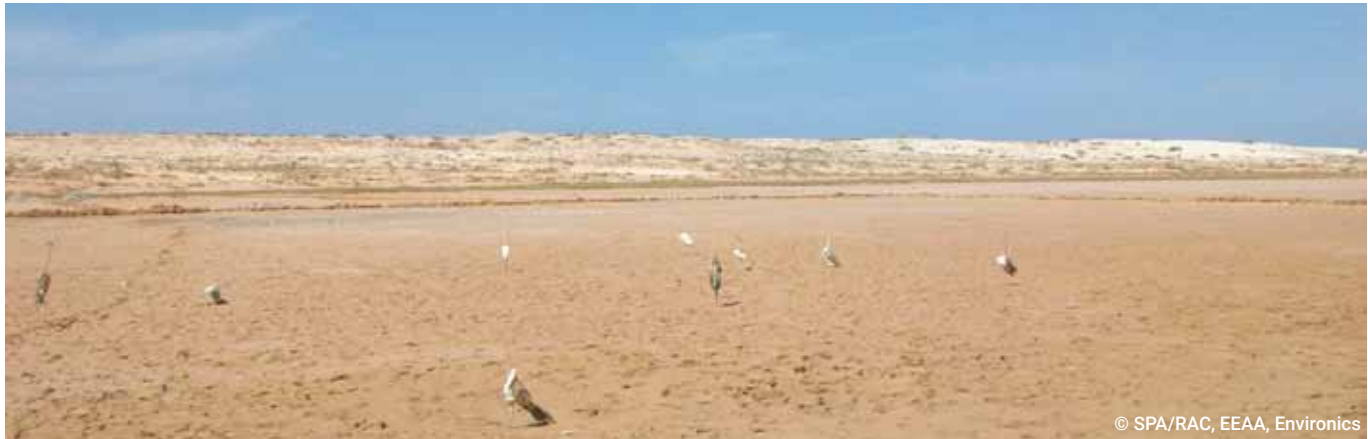
Figure 20: Trap basins used to attract migrating birds

The average cost of the basin is estimated at LE 20-30 thousand depending on the size. About 10-15 persons work on the preparation of the basin for that month. Within discussions with two of them, it is made clear that they take this job as secondary economic activity. Around the year, people like them work in the area of construction in Salloum. Annex III provides list of birds recorded in Salloum MPA.