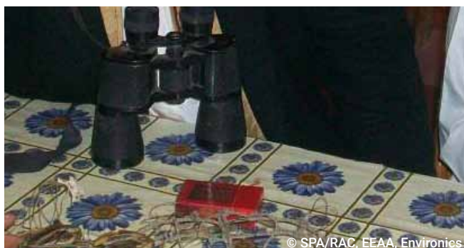
Figure 23: Equipment used for hunting falcons

As for other quail, it has been explained that hunters use voice machines that imitates the sound of quail to trick the birds. This sound is assumed to trick the entire swarm of birds which reaches 200-300 head. It is also explained that the Houbara Bustards is decreasing in numbers, but is still used by Gulf princes for fine food ceremonies. Therefore, a prince from the Gulf area proposed MPA in the western north coast by which the hunting of this bird will be prohibited for five years and a park for the reproduction of Houbara Bustards is established. Participants were regretting that such a project is rejected by the government «It would have been a good opportunity to employ locals by the project on one hand and to reproduce the Bird on the other hand.....» The MPA could have generated national income using local resources....and it can be also replicated in other regions». They also mentioned a proposal for an open park for birds' reproduction on top of the hill called Ard El Gazala».