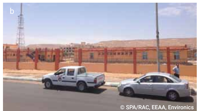
Figure 27: The Armed Forces social club in Salloum