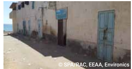
El Wehda El Arabeya Hotel