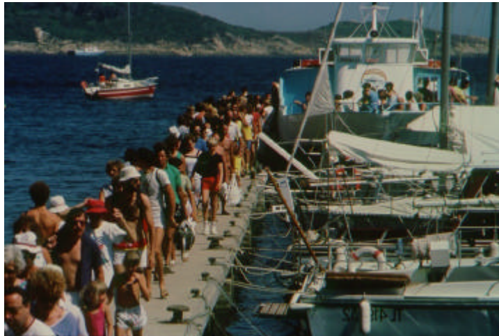
Seaside activities are major source of ecosystem disturbance.

sources of disturbance to fauna (monk seal, turtles), direct mortality by boats (turtles, sharks), and degradation of certain marine biocenoses (caves, by diving).