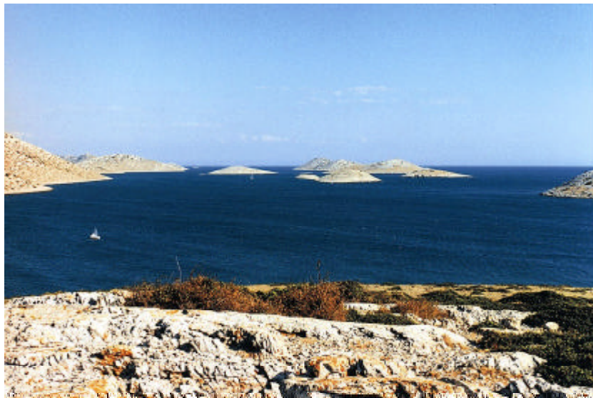
The Kornati islands National Park. D. Grlica

There are ten protected areas on the Croatian littoral, 5 National Parks and 5 Nature Reserves: the Brini Islands National Park, the Kornati Islands National Park, the Krka National Park, the Paklenica National Park, the Mljet National Park, the Limski Zaljev Nature Reserve, the Lokrum Nature Reserve, the Malostonski Zaljev Nature Reserve, the Neretva Delta Nature Reserve (Ramsar site), the Suma Dundo na Rabu Nature Reserve (Dundo Forest-Rab Island).