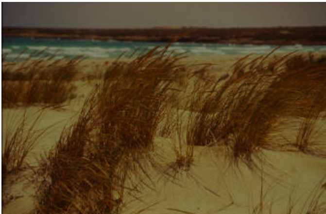
The plant formations stabilize the dunes and the beaches. M.N. Bradai

The main disturbance of the sandy environments comes from work done to develop tourist activity. Infrastructure development is the main threat hanging over sandy coastal environments. In countries where tourist development is rapid and uncontrolled, the littoral dunes constitute deposits of sandy material for building work. Removal of the sand brings about the disappearance of the plant formations that stabilize the dunes, which thus become vulnerable to erosion by water and – especially – wind. Dune environments, easily worked by public works equipment, are also choice environments for building the transport and accommodation infrastructure of seaside resorts. Channels that communicate with wetlands are also places that attract the building of sea walls and ports.