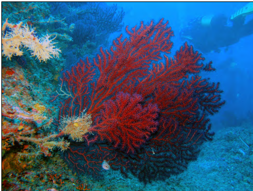
Figure 1. Coralligenous habitat.

The two most important and characteristic calcareous formations of biogenic origin in the Mediterranean Sea are represented by coralligenous reefs (Fig. 1), an endemic complex habitat considered as the climax biocenosis of the circalittoral zone (Pérès and Picard, 1964), and maërl/rhodoliths seabeds (Fig. 2) (UNEP/MAP-RAC/SPA, 2008). These bioconstructed habitats develop in the Mediterranean circalittoral zone and are built-up by coralline algal frameworks that grow in dim light conditions. Coralligenous is characterised by high species richness, biomass and carbonate deposition values comparable to tropical coral reefs (Bianchi, 2001), and economic values higher than seagrass meadows (Paoli et al. , 2016).