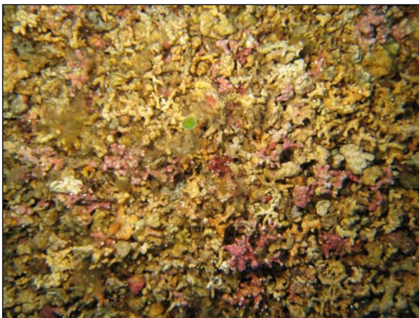
Figure 2. Rhodoliths habitat.