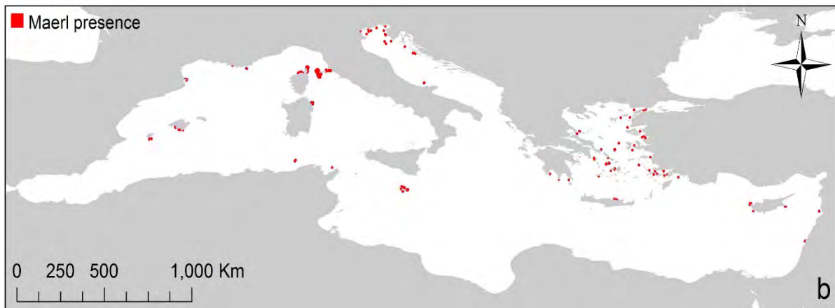
Figure 4. Distribution of maërl habitats in the Mediterranean Sea (red areas). Data from Martin et al. (2014)

Rhodoliths/maërl habitat is classified by the recently revised EUNIS classification system with the codes: MB3511 Association with rhodolithes in coarse sands and fine gravels mixed by waves, MB3522 Association with maërl (= Association with Lithothamnion corallioides and Phymatolithon calcareum ) on Mediterranean coarse sands and gravel, MC3523 Association with maërl ( Lithothamnion corallioides and Phymatolithon calcareum ) on coastal detritic bottoms. The recently revised Barcelona Convention classification (UNEP/MAP-SPA/RAC, 2019b) classifies this habitat with the code MC3.52: Coastal detritic bottoms with rhodoliths.