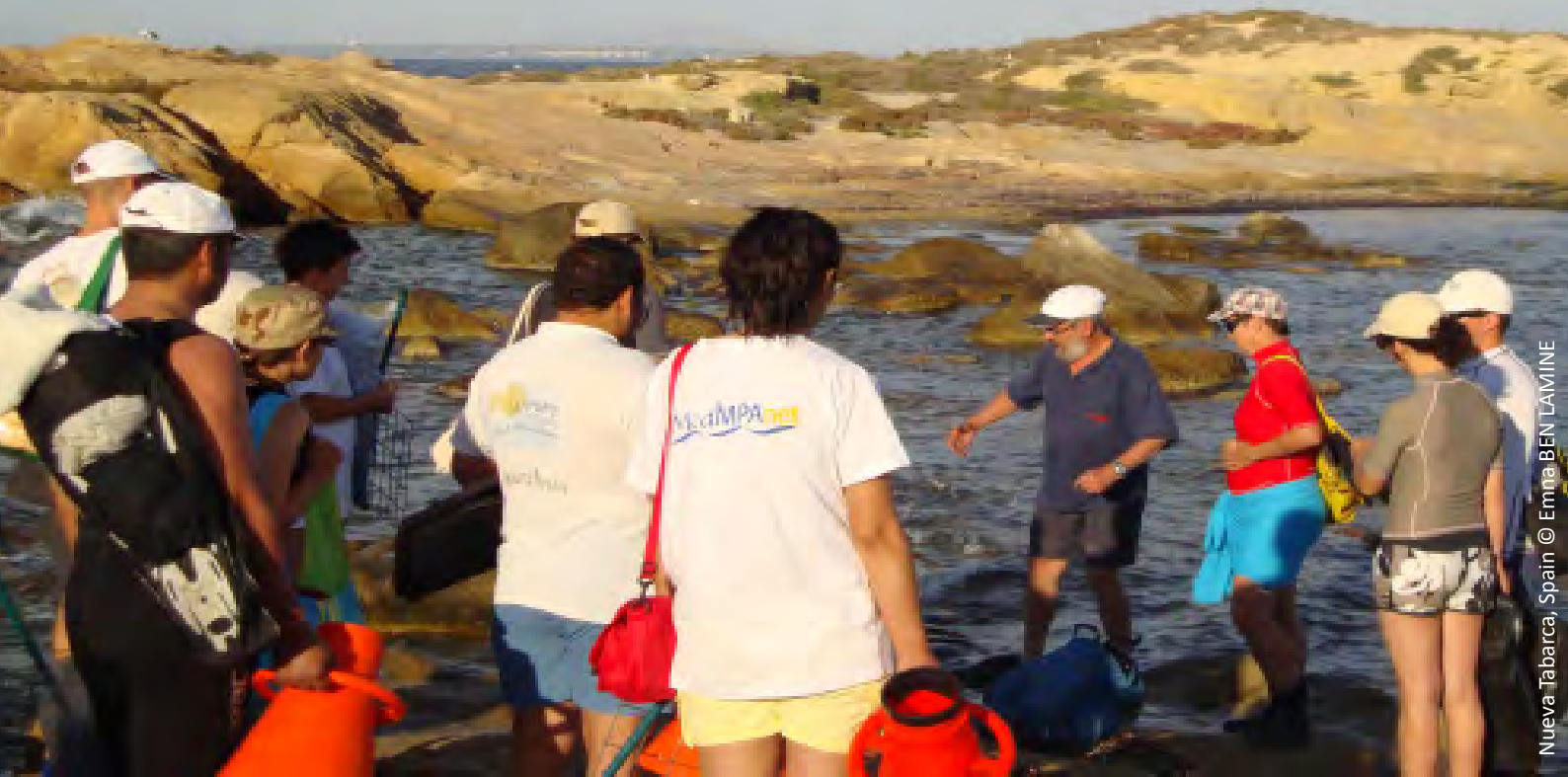
Nueva Tabarca, Spain © Emma BEN LAMINE