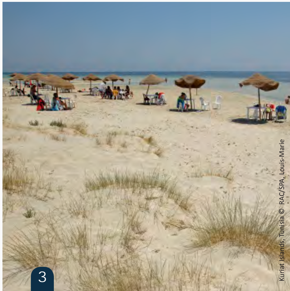
Kuriat Islands, Tunisia