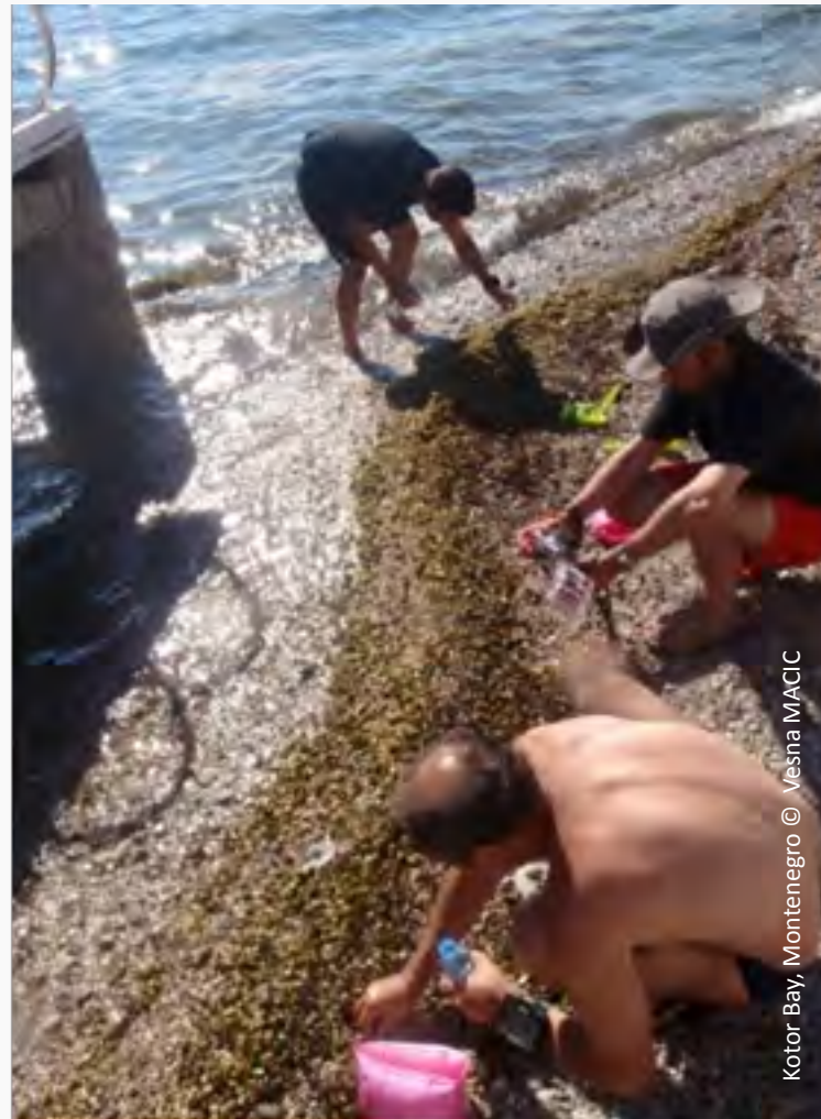
Kotor Bay, Montenegro