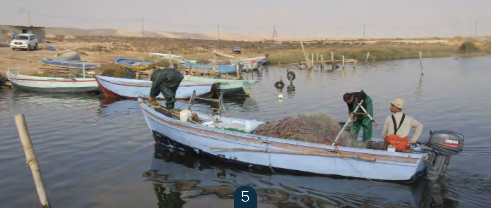
Ain Al-Ghazala, Libya