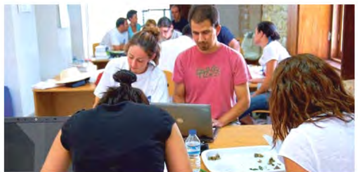
El CIMAR es referente en la formación de investigadores en el Mediterráneo