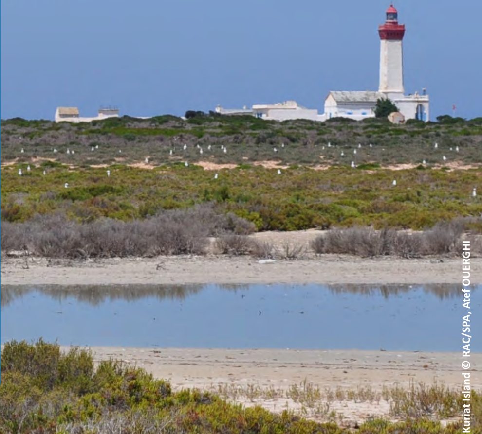
Kuriat Island

Third Meeting of SAP BIO National Correspondents / MedMPAnet Project Mid-term Workshop P.7