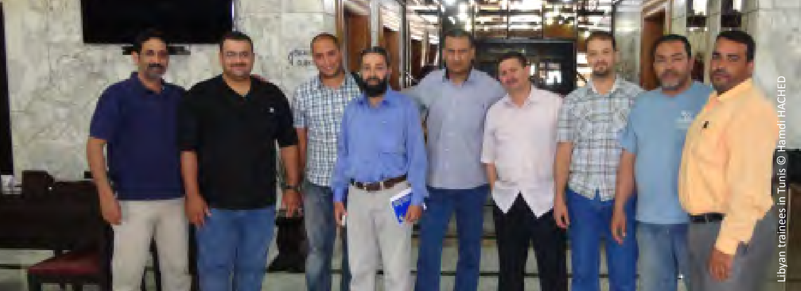
Libyan trainees in Tunisia