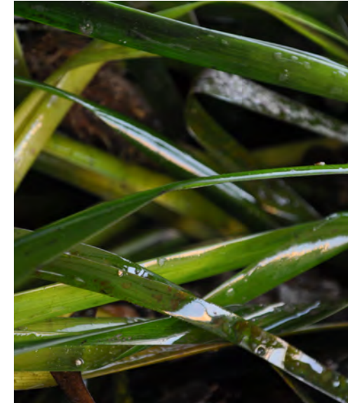
F. TITLE OF PARTNER OF THE ACTION PLAN 15