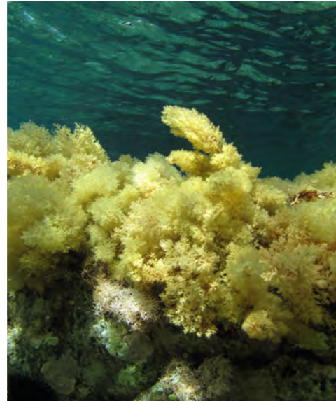
B. PRIORITIES 08