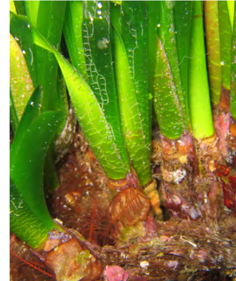
E. PARTICIPATION IN THE IMPLEMENTATION 15