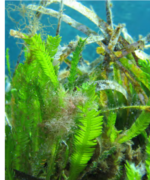
D. REGIONAL COORDINATION STRUCTURE 14