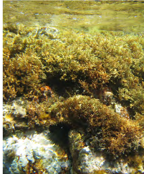
A. OBJECTIVES 07