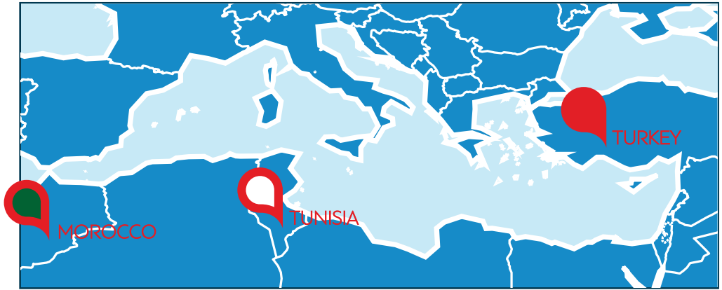
PROJECT INTERVENTION AREA