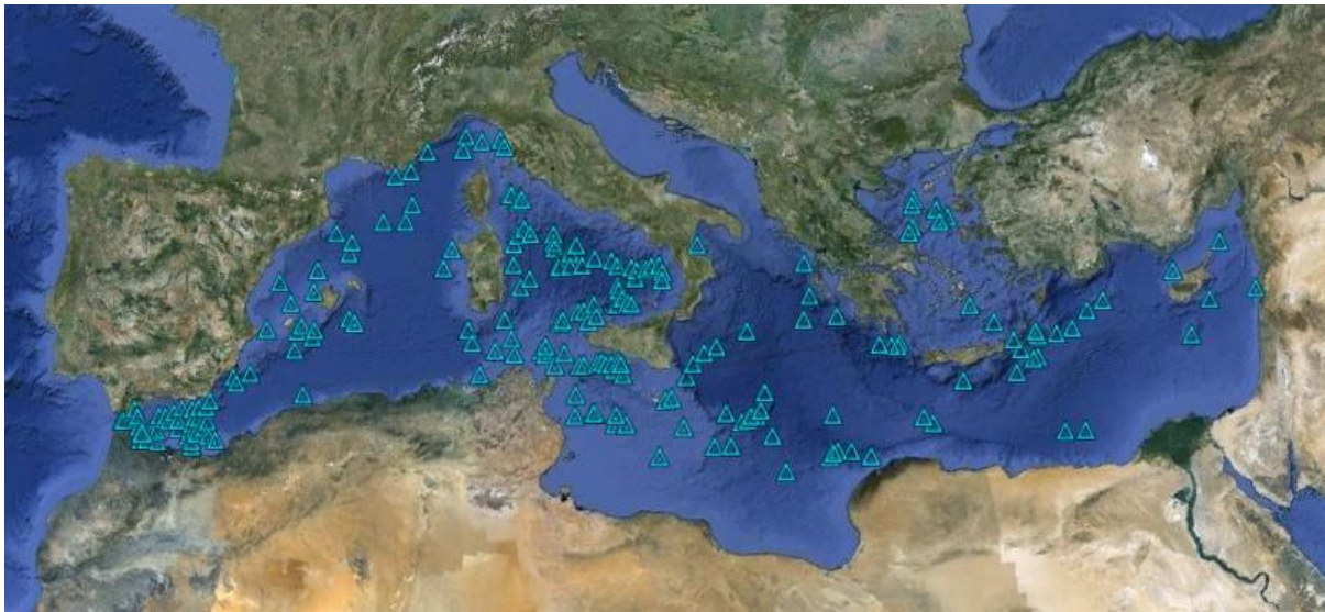
Figure 4: Distribution of the main Mediterranean seamounts

At present, these seamounts are little taken into account in terms of conservation since only that of Eratosthenes (eastern basin) has since 2006 been included as a restricted fishing area by GFCM [3].