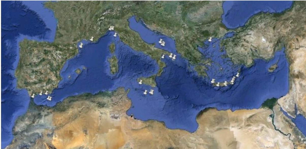
Figure 2: Location of some populations of structuring invertebrates in the Mediterranean. These are mostly ‘deep water corals’ (after authors of Document & [8], [9], [10]).

Their presence can thus be a necessary precondition for setting up specific measures. Although at present they are still not much taken into account in terms of conservation, since only the Santa Maria de Leuca reef with Lophelia and Madrepora has since 2006 been included as a restricted fishing area by GFCM [11], they are at the origin of the creation of MPAs (e.g. the Cassidaigne and Lacaze-Duthiers canyons, France). Similarly, two sites have been chosen to this effect by Italy (Continental slopes of the Tuscan Archipelago and Santa Maria de Leuca sector) for setting up the Natura 2000 at-sea network, and many are included in the proposal to set up a representative MPA in the Sea of Alboran [6].