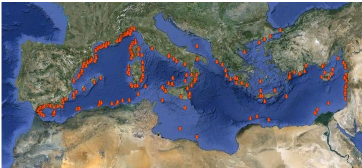
Figure 1: Distribution of main canyons identified in the Mediterranean (after authors of Document & [3], [6]). Map: Google earth©