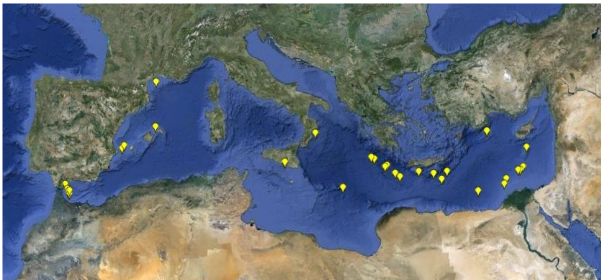
Figure 3: Locating chemo-synthetic populations that have been studied in the Mediterranean (after authors of Document & [6], [12], [13], [14], [15]).

'Cold seeps' seem to be well represented along the Mediterranean fold (eastern basin; Figure 3). 'Mud volcanoes' are frequent in the eastern basin especially at the level of the Mediterranean fold and in the south-east of the basin, but the discovery of 'pockmarks' around the Balearic Islands allows us to envisage their existence in the western basin (Acosta et al., 2001, in [12]; Figure 3). Lastly, six hyper-saline anoxic lakes have been localised at the level of the Mediterranean fold [4] (Figure 3).