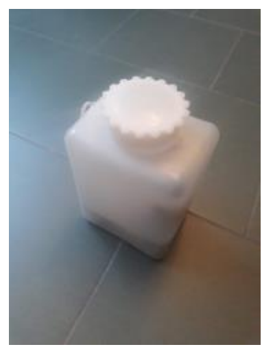
Figure 4 Plastic-box for collected organism