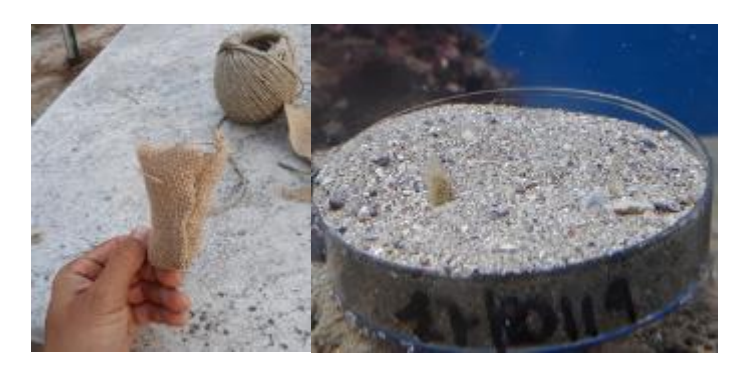
Figure 6 Juta bag and Petri dish

For stabling and growth operations, attention must be given above all to maintaining the optimal chemicalphysical conditions. Although the Pinna nobilis is a very resistant and adaptable bivalve mollusc (it survives even for short periods out of the water) we try not to produce large fluctuations in the tanks during normal maintenance operations. The photoperiod should be adjusted according to the seasonality of collection and gradually varied according to the progress of the seasons. As far as the growth is concerned, it is possible to proceed with the insertion of nutrients or, if the tank already has a started ecosystem (at least 5 cm of sediment, different stones, vegetable and animal organisms present) then it is also possible not to insert nutrients for the fans. If the tanks instead are only filled with water without any kind of ecosystem started, then it is recommended to insert once a week a microalgal culture concentrate in the tank.