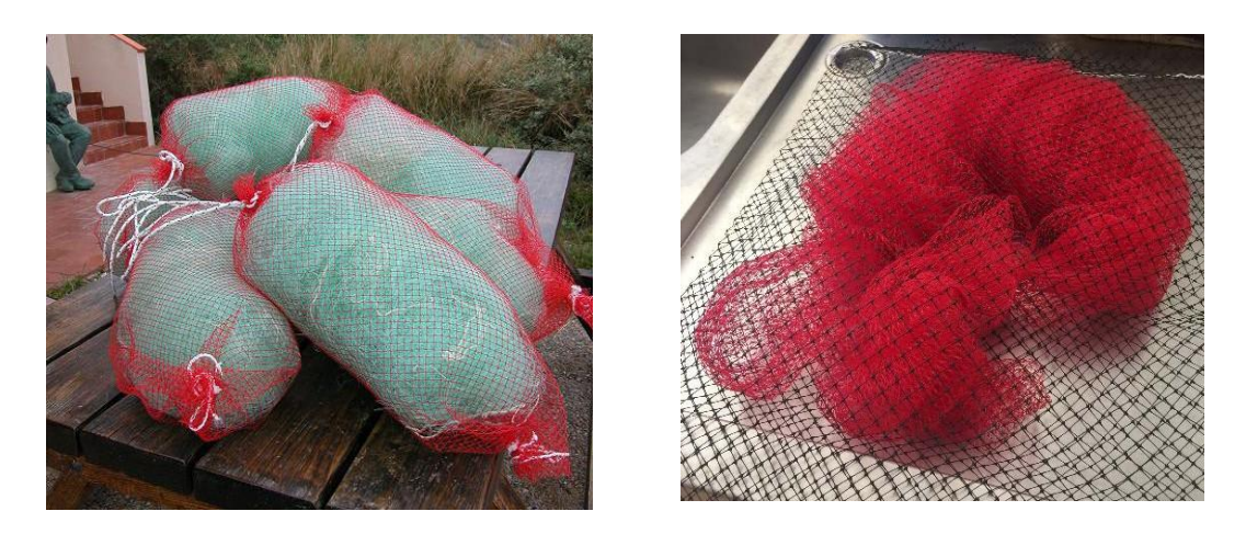
Fig. 1 . Two different bag designs. Left. Entangled nylon (trammel net) inside plastic mesh bags. Right. A similar outer plastic bag but using onion nets as substrata inside.