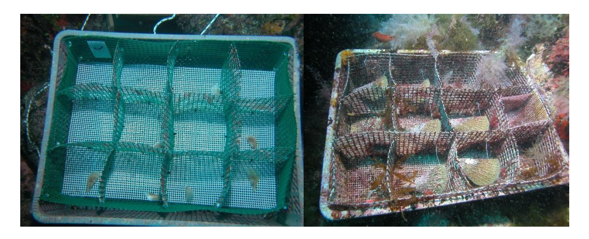
Fig. 5 . Left. Juveniles just extracted from the collectors and placed in the protection cage (in the field). Right. Pinna nobilis individuals of approx. 2-3 years of age in the protection cage. Notice the photographs have been taken without the mesh protection covering the cages.

Juveniles can be placed in protection cages in the field where they will continue growing, giving the possibility of re-implanting them in suitable substrata when a certain size is reached (Fig. 5). See Kersting & García-March (2017) for further information.