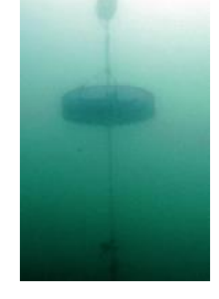
Figure 1Horizontal collector

We then proceed with the preparation of the captation structure (Figure 1) consisting of 1 ballast, a rope with a maximum length of 2 meters, a float and the collector. Among the 2 collection systems tested (vertical and horizontal) the horizontal system was preferred. A circular lanter-net (plastic devices used in ostrey maricoltures) is therefore used on which it is possible to fix various types of textile material to increase the efficiency of collection. Simplest method is put inside the lanternet some textile material like potato-bag, jute bag, ropes etc. This method help juveniles to attached helding larvas.