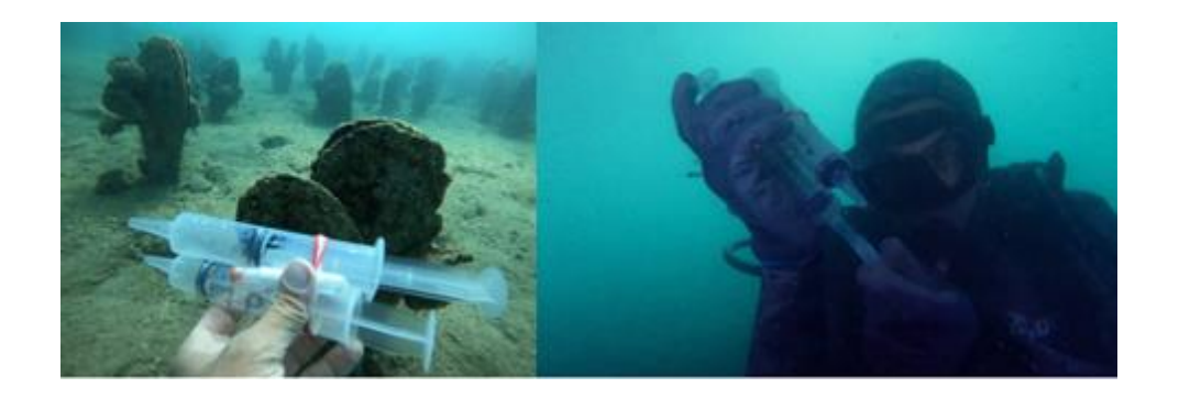
Figure 7 Underwater operations

pellets. After sampling, biological material are conserved in alcool (90°) and put in freezer at -80°C, ready for the genetic analysis.