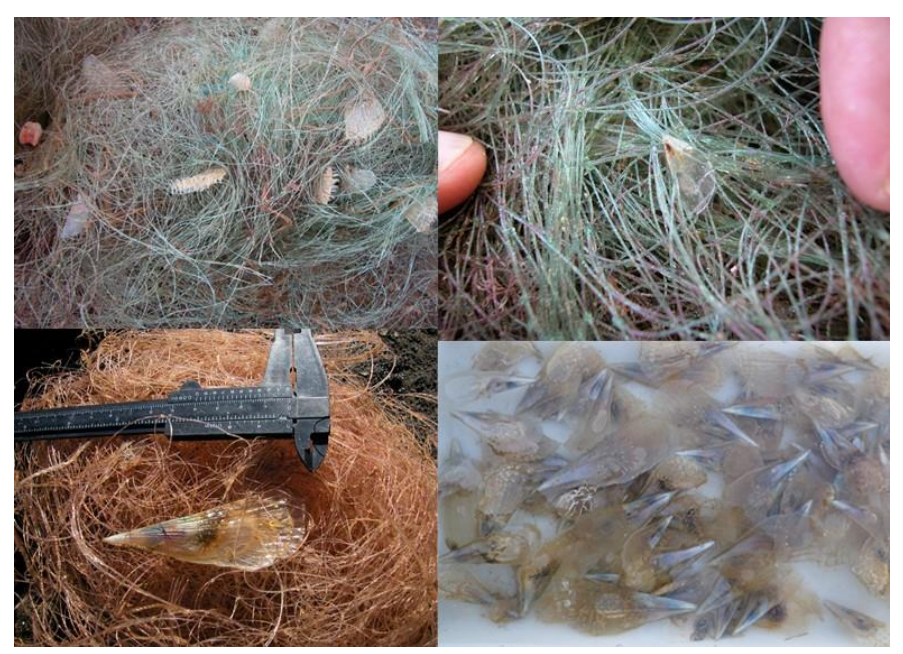
Fig. 4 . Pinna nobilis juveniles settled inside the collectors. Notice different morphologies and sizes. Juveniles have to be kept in seawater immediately after extraction from the bags.

At the end of the installation period juveniles' sizes (antero-posterior length) may range approx. from 0,5-9 cm. In general, they can be seen by the naked eye inside the tangled fibers (Fig. 4). They have to be removed carefully in order not to break the fragile valves. Juveniles should be immediately placed in seawater after their extraction from the collector bag (Fig. 4).