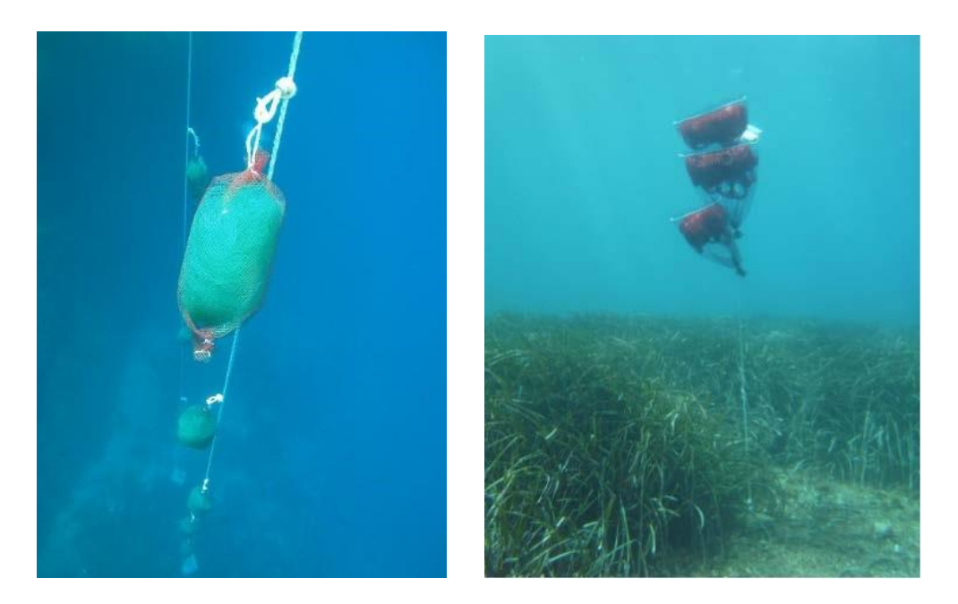
Fig. 3 . Larval collector bags attached in 1,5 m intervals in a deep site (left) and a shallow site installation (righty).

There are several ways to distribute the bags along the rope. In deeper sites the bags can be attached in approx. 1,5 m intervals throughout the rope (Fig. 3), thus covering a wider depth range. In shallow sites the bags can be attached in a single point (Fig. 3). It has been observed that P . nobilis larvae settle in collectors in a wide depth range, so both deeper (for example 15 m) and shallower (for example 5 m) collector installations are possible.