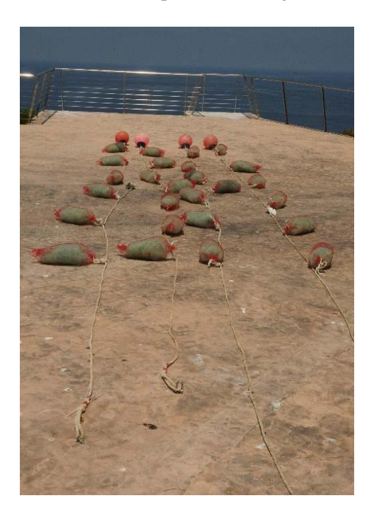
Fig. 2. Collectors' bags attached to the main rope and buoy ready to be deployed.

The bags are attached to a main rope (Fig. 2). The whole system is fixed to a small concrete mooring (or similar, but it must be heavy enough to prevent dislocation by waves and currents) and the rope is kept vertical by a submerged buoy. Submerged buoys (depth > 3m) prevent the whole system to be seen from the surface and potential entanglements with boats.