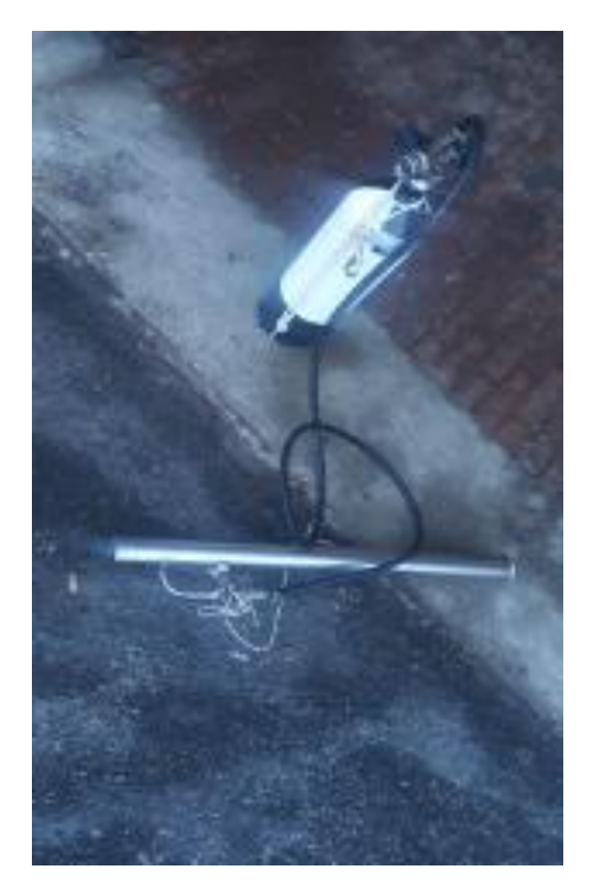
Figure 5 Sorbonne

we proceed with the extraction of the fin with the whole stone. If the fin is attached to a rock, then proceed by cutting the byssus in the proximity of the rock without damaging the byssus gland.